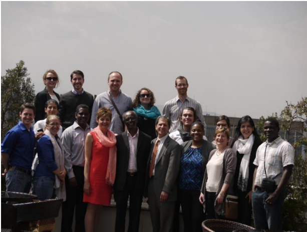
UMass Boston Team in Addis Ababa

On January 16th, 2016, UMass Boston's Integrated Graduate Education and Research Traineeship (IGERT) fellows arrived in Addis Ababa, Ethiopia. For some, this was the first trip to the continent, or even a developing country. Their agenda was packed with meetings and introductions to professors, researchers, and various professionals; the goal was to become acquainted with the environmental challenges present in the Horn of Africa.